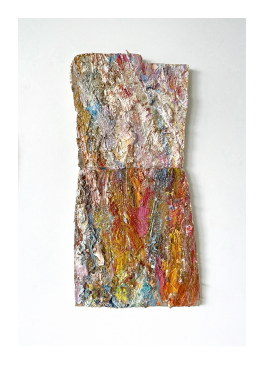
Dorothy's Dress, 2022, Oil on linen, 15" x 8"