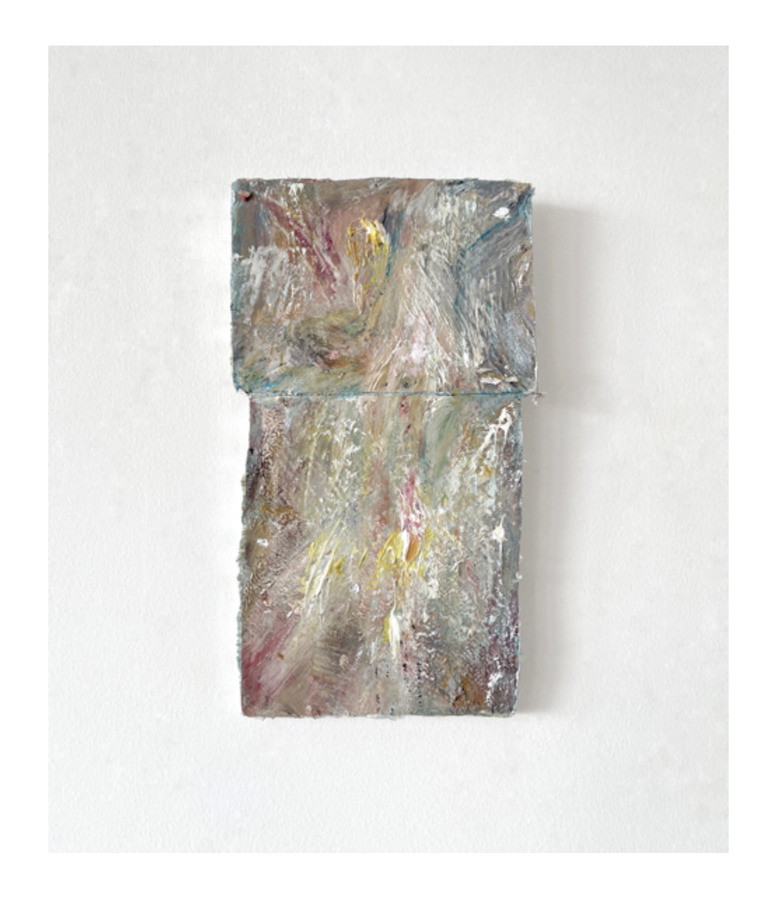
Misguided Angel 2, 2021, Oil and silver leaf on linen, 7" \times 4"