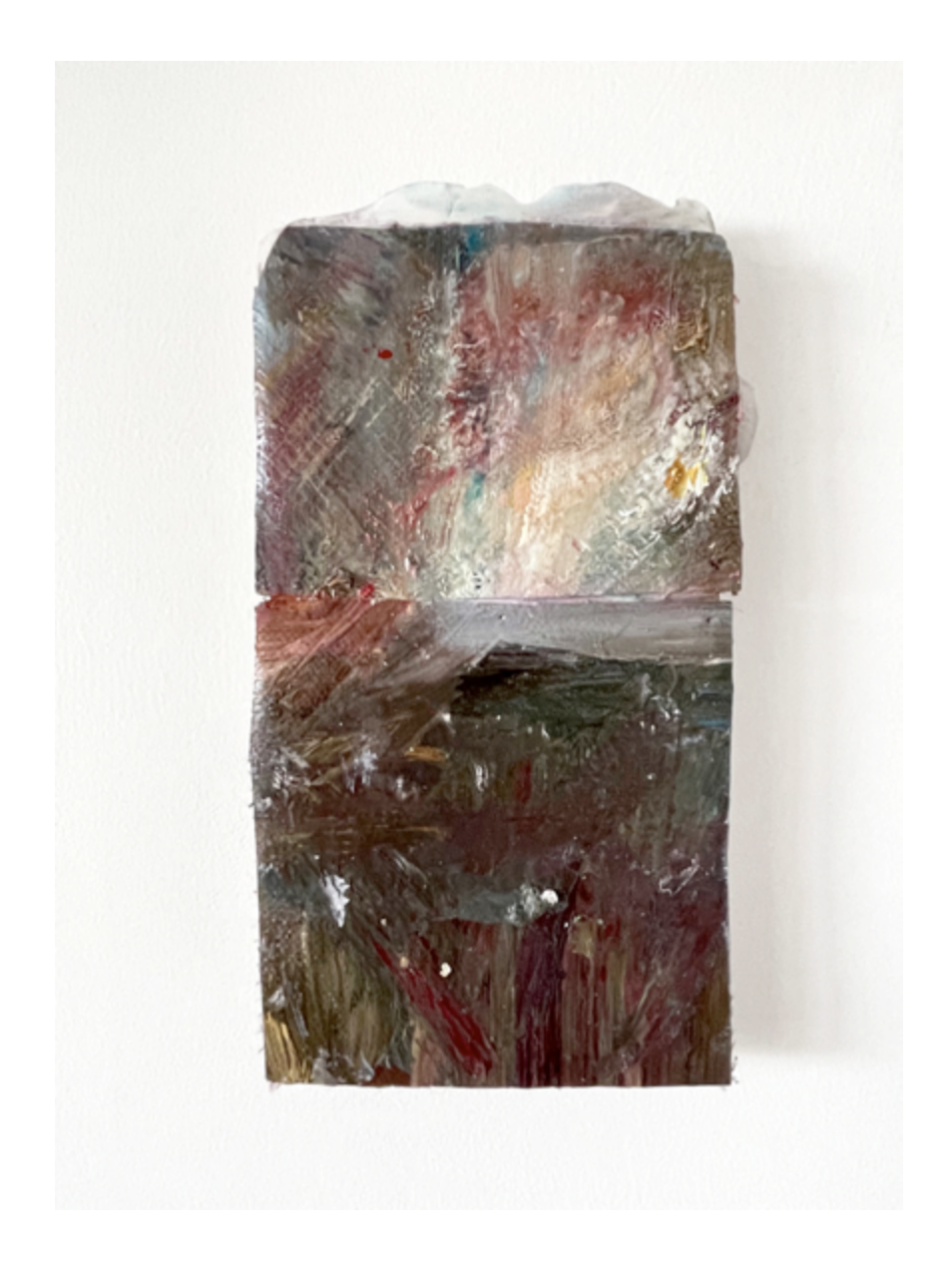
Misguided Angel Love You Till the Day I Die, 2021, Oil on linen, 7" \times 4"