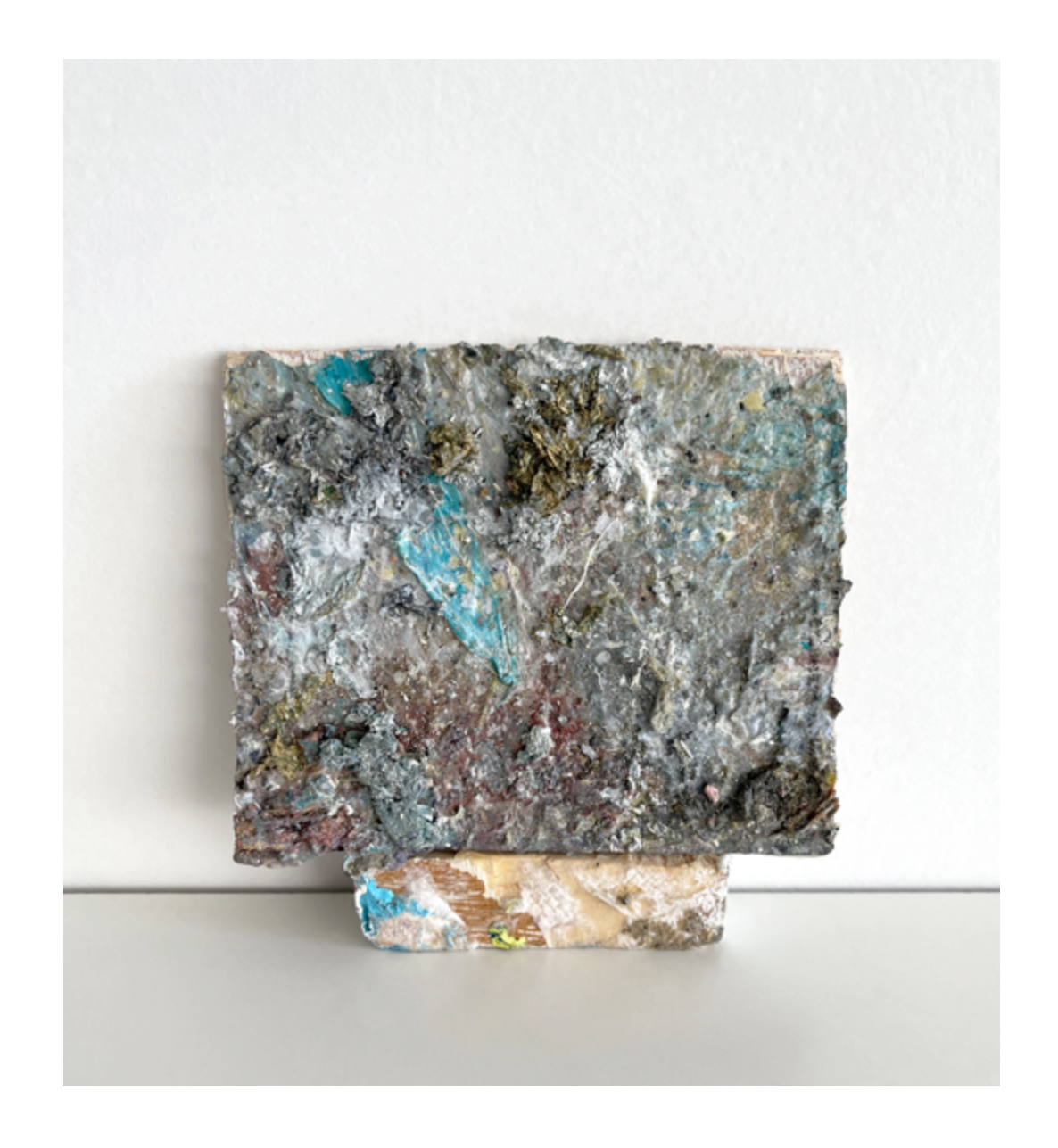
Abadiania 1, 2021, Oil on panel, 3.5" x 4"