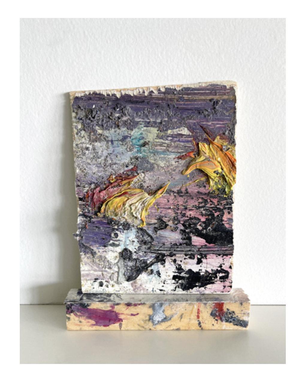
Abadiania 2, 2021, Oil on panel, 5" x 3"