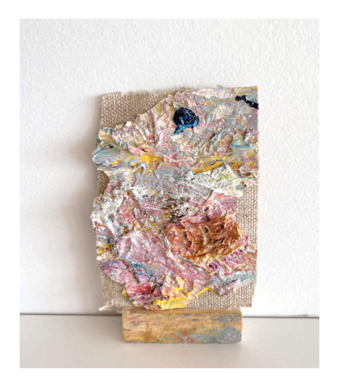
Dark Star, 2021, Oil on linen and wood, 4" x 3"