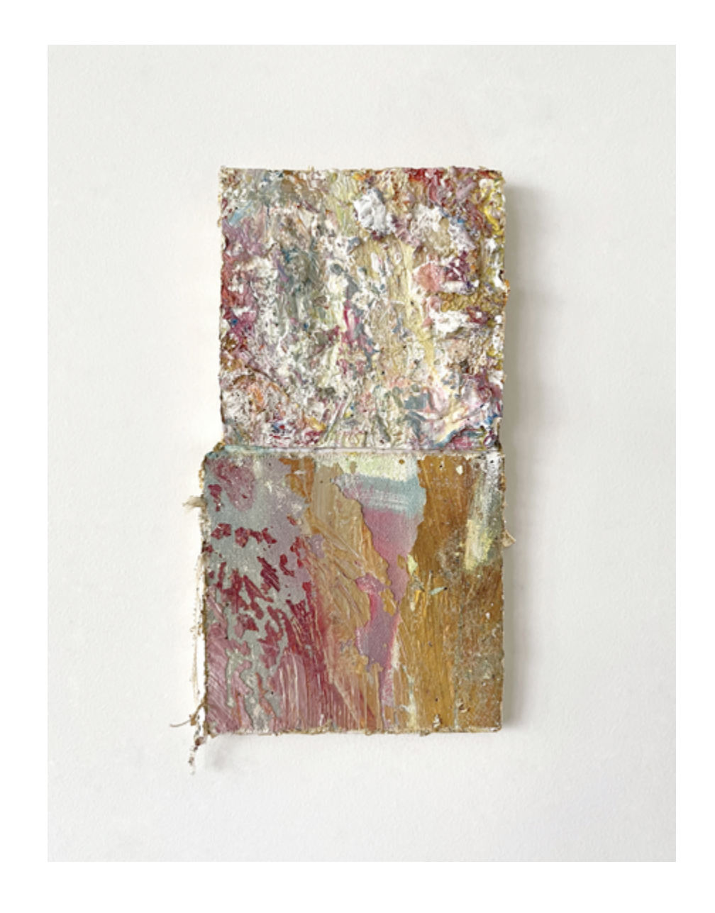
The Veils 2, 2021, Oil on linen, 8" x 4"