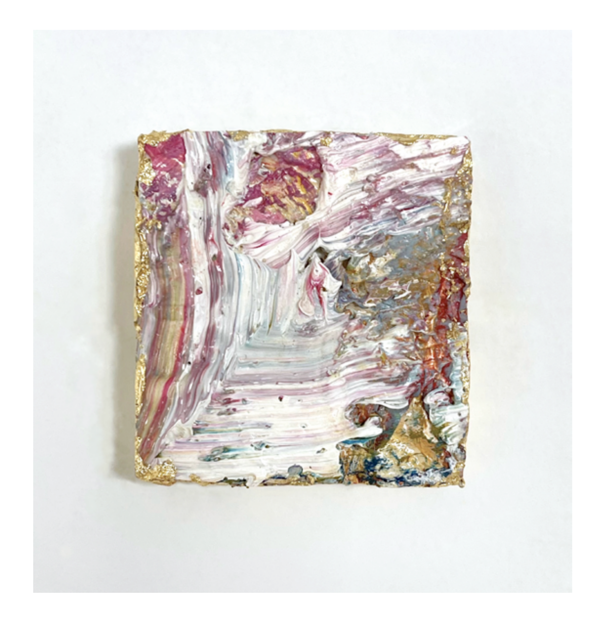
Saucers of Milk, 2021, Oil on canvas, 2" x 1.75"