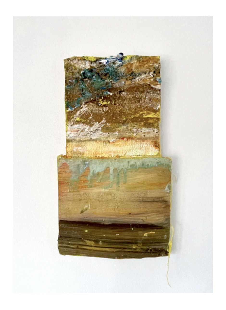
Morning, 2021, Oil on panel, 8" x 4.5"