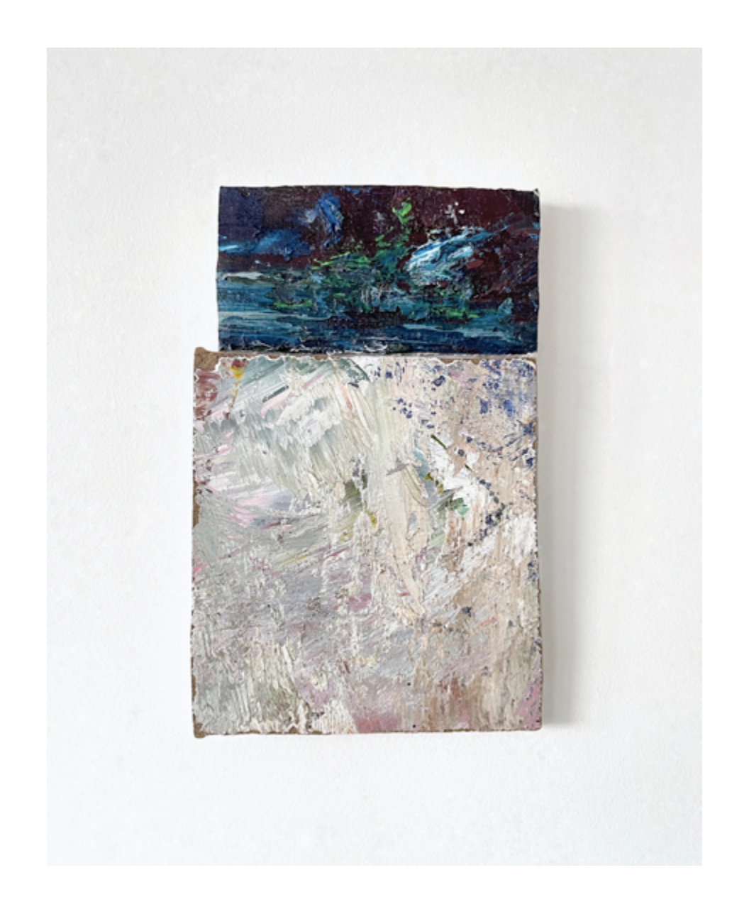
Morning Has Broken 2, 2022, Oil on linen and board, 8" \times 6"