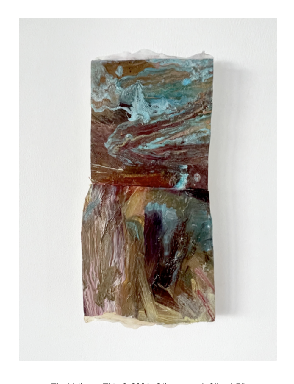
The Veils are Thin 2, 2021, Oil on panel, 9" x 4.5"