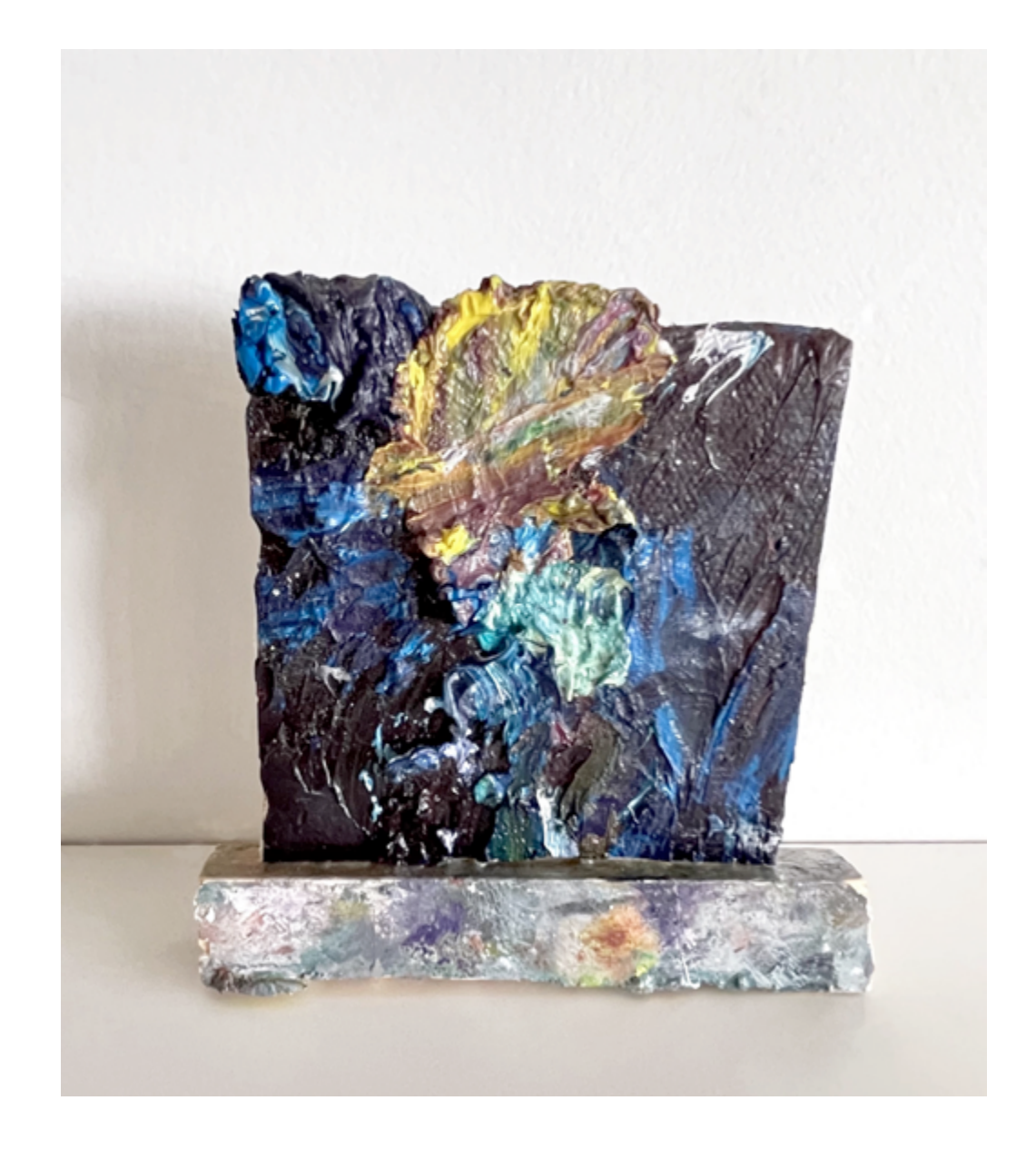
But Soft, 2021, Oil on panel, 4" x 4"