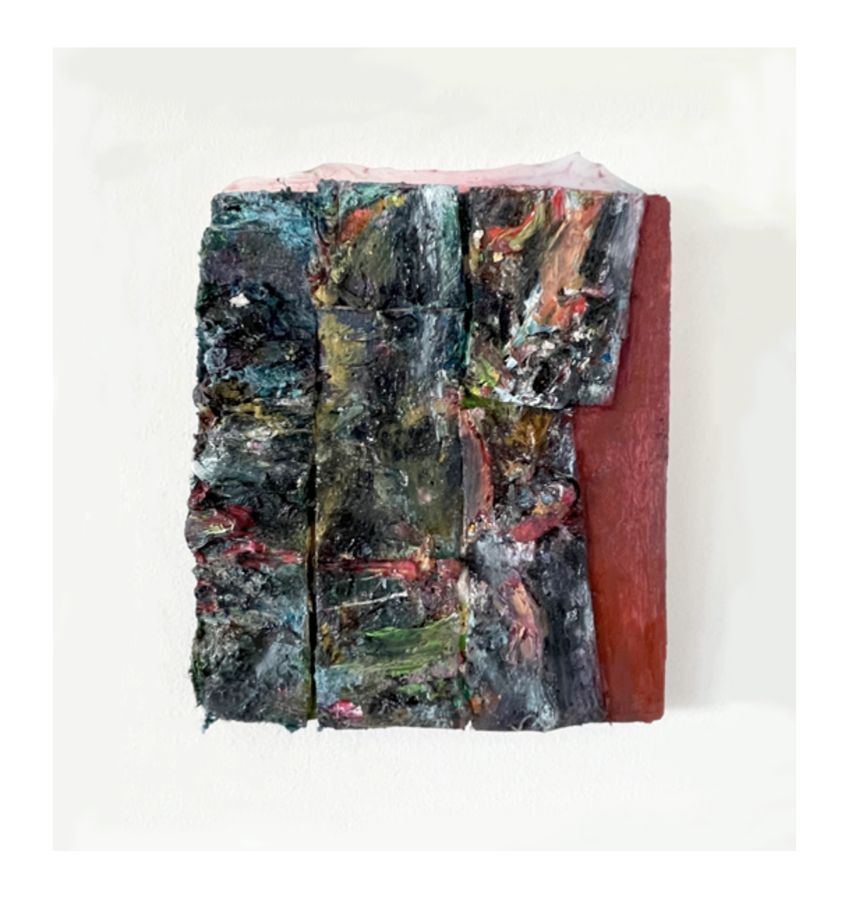
Pieced Together 1, 2021, Oil on panel, 5" x 6"