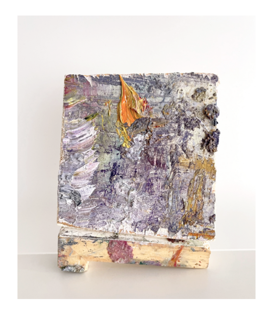
Orphic, 2021, Oil on panel, 4.75" x 3.75"