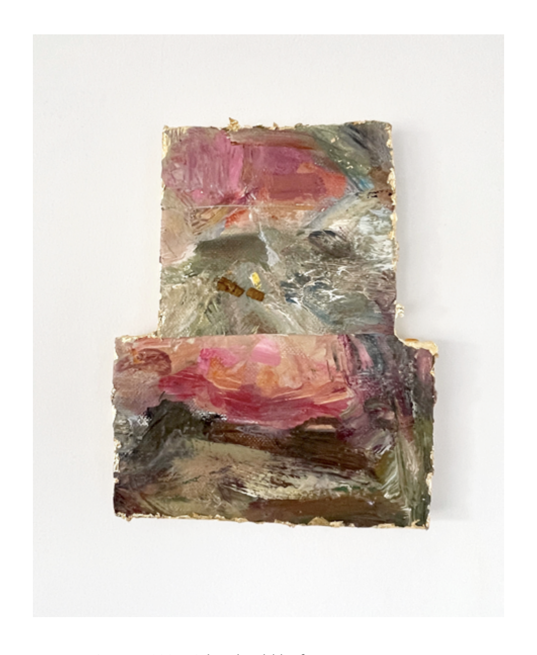
George, 2021, Oil and gold leaf on canvas, 7.5" x 6" \,