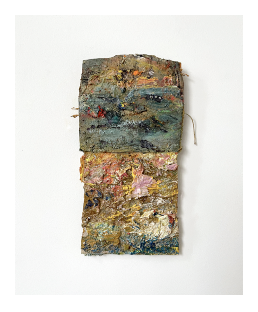
Darkness Travels at the Speed of Light, 2021, Oil on canvas, 7.5" x 4" \,