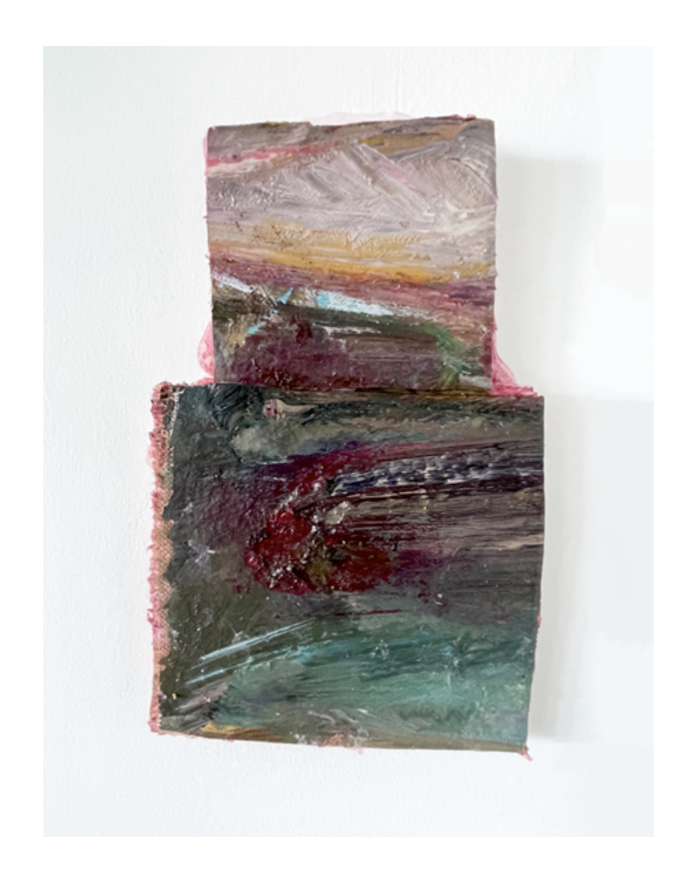
Light in Darkness, 2021, Oil on canvas, 8" x 5"