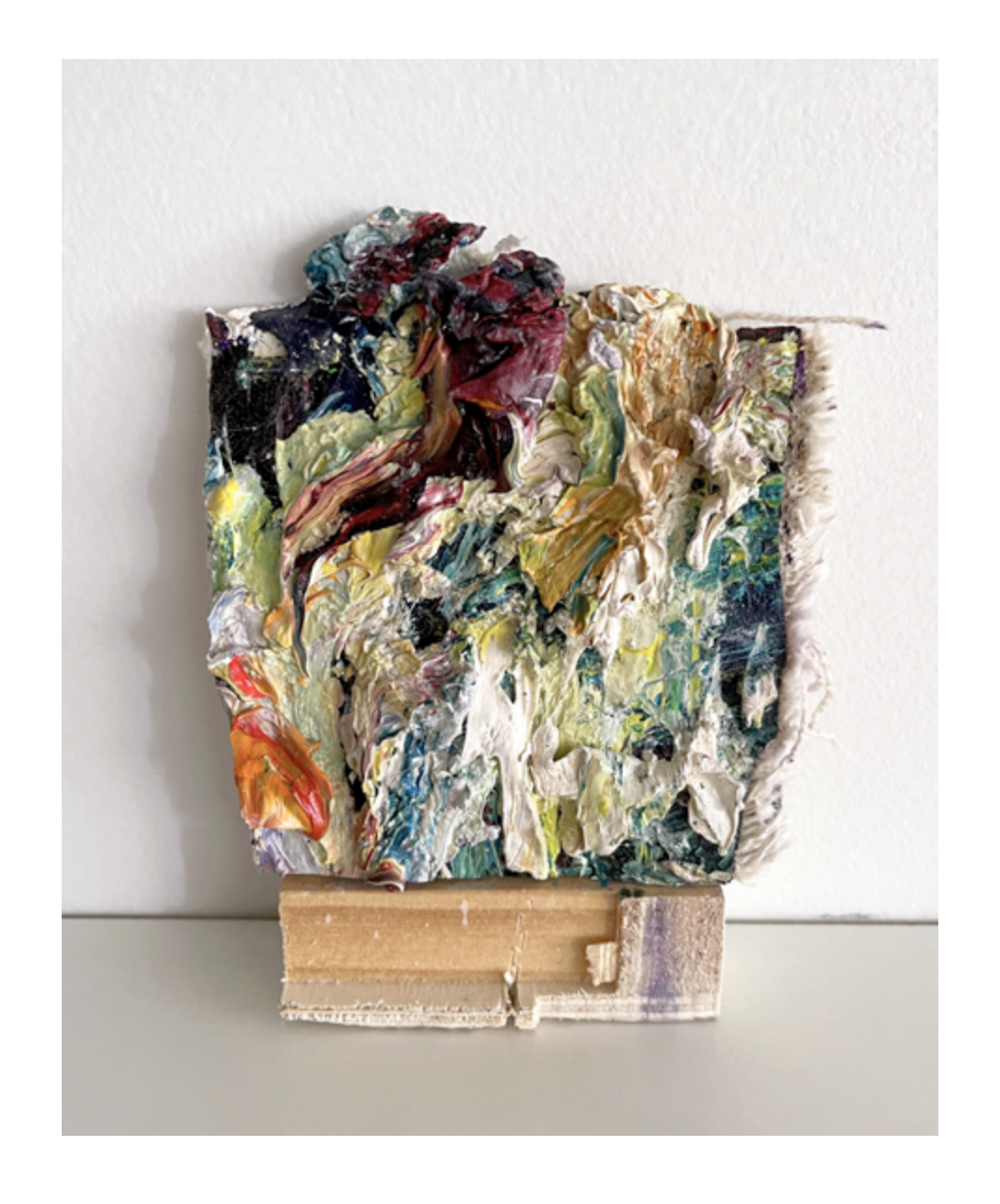
Second Beach, 2021, Oil on canvas and wood, 5" x 3.5"