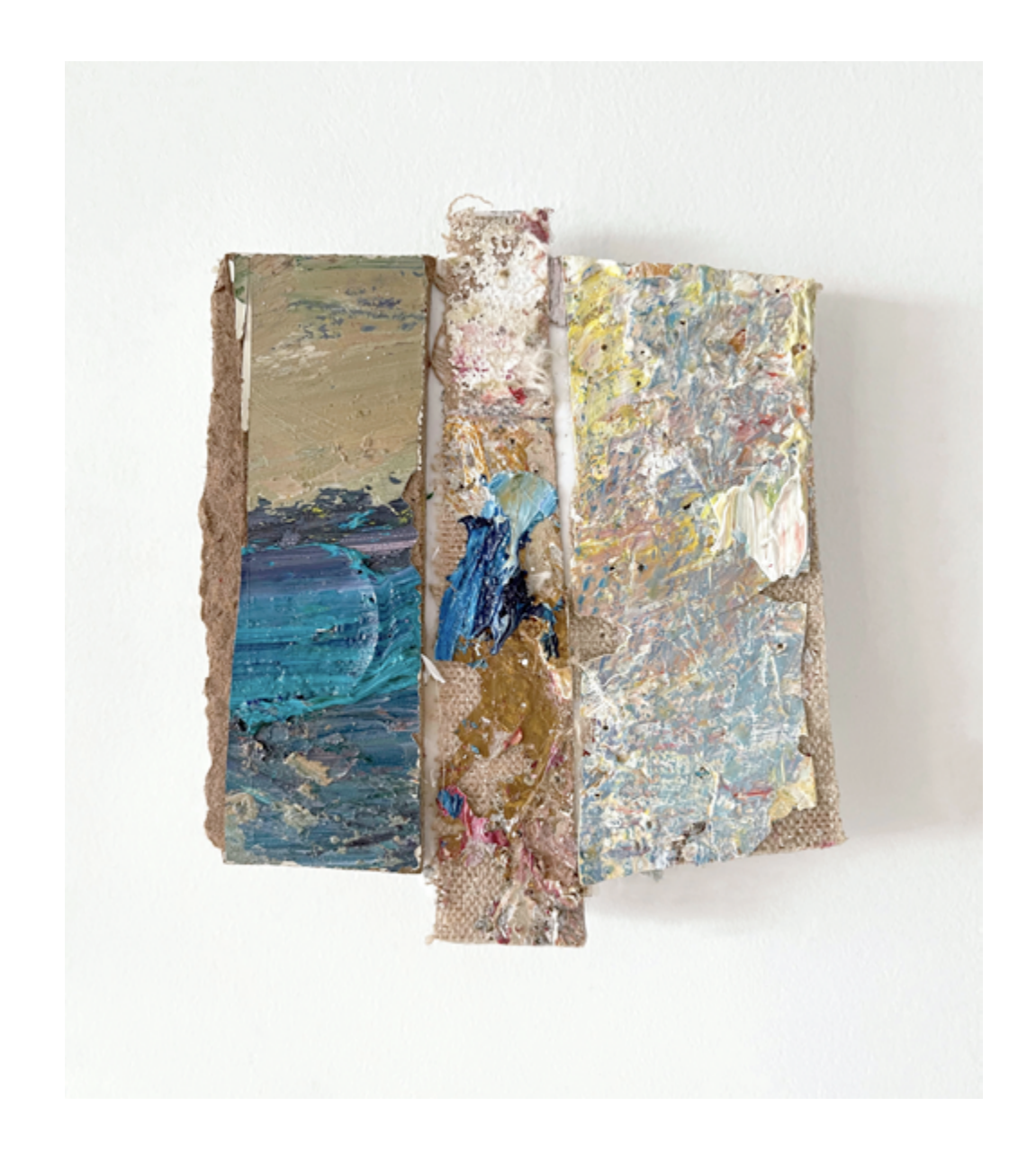
Morning Has Broken 1, 2022, Oil on linen and panel, 5" \times 4"